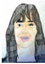
Rachel Hook (Portrait of Mandi, coloured pencil, 2011)