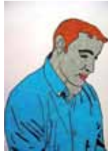
Scott Cation (Portrait of Alister, felt tip pen, 2011)