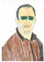
Kubus Joss (Portrait of Stuart, coloured pencil, 2011)