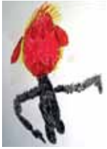
Fiona Birrell (Portrait of Shona, pen, 2011)